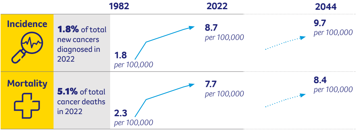
Figure 1: Liver cancer statistics in Australia. Sources: AIHW Cancer data in Australia 2022; Luo Q et al Lancet Public Health. 2022 Jun 1;7(6):e537-48.

Liver cancer, of which hepatocellular carcinoma (HCC) accounts for the greatest burden, has increased rapidly in incidence and mortality in Australia over recent decades and is projected to increase further by 2044 (1,2) [see Figure 1]. The Northern Territory recorded the highest liver cancer incidence and mortality rates for liver cancer in 2015, both 13 per 100,000 people (3). Liver cancer mortality rates in Australia continue to grow faster than any other cancer in Australia (1). Liver cancer incidence rates are higher amongst males (3 times that in females) (1).